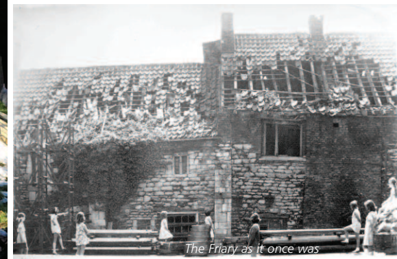
The Friary as it once was