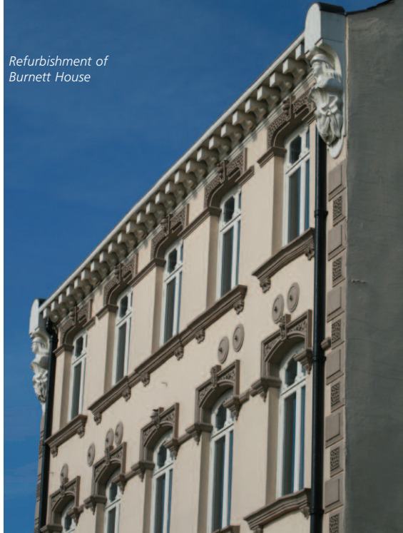
Refurbishment of Burnett House

S Voase Builders Ltd, Fretwells Business Park, Oslo Road, Sutton Fields Industrial Estate, Hull, HU7 0YN.